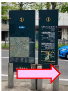
Sign in front of exit