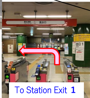
To Station Exit 1